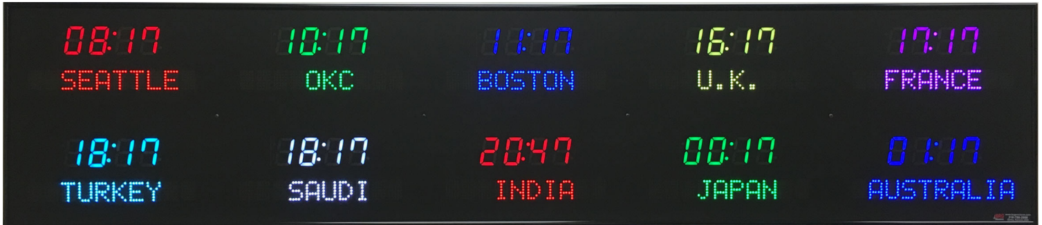
Model 6612C - 1.8" time, 1.2" zone labels, 10 zones